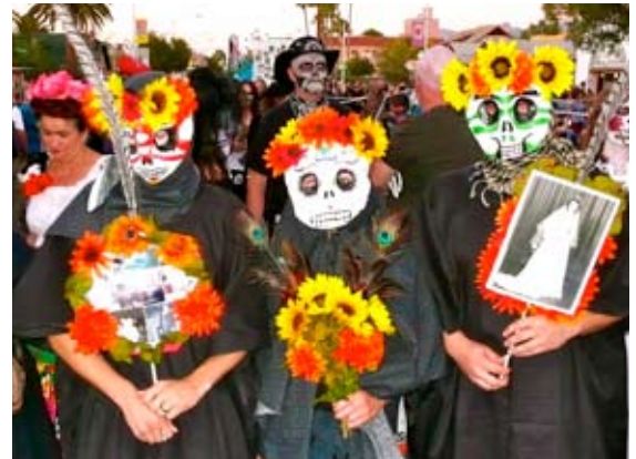
Participants in the All Souls Procession typically dress up in elaborate costumes inspired by Dia de los Muertos, celebrating the lives of those who have passed on and honoring their ancestors.

People who walk in the procession typically wear elaborate costumes and makeup to reflect Die de los Muertos, and often walk with photos and mementos of their deceased loved ones. It's a family friendly event with over twenty thousand participants. There are scores of stilt-walkers and acrobats, along with exotic floats and people of all ages dressed up in ever more creative ways. A ritual for Tucson and a community event creating connections across cultures, the parade also raises awareness of many important issues. Last year, for example, a group gained international media attention for their remembrance of gay youth who had committed suicide after being bullied. In addition, much attention was given to border issues and other social justice causes. The event is organized by Many Mouths One Stomach, and donations are collected along the procession route as well as before and after the