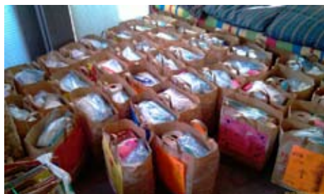
When an emergency arose in January, Grace St. Paul's stepped up to help sponsor Poz Café. Our parishioners donated enough toiletries to fill forty bags which were given out to needy HIV/AIDS patients at the event. Thanks to every one of the many donors at GSP! You made a significant difference in the lives of forty wonderful people!