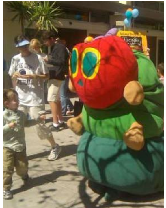
Eric Carle's Very Hungry Caterpillar from the children's area of the 2010 festival.

War II, and hear Celtic prayers from the Iona community in Scotland, founded after World War II as an inspired challenge to classism and poverty. We will remember that today Taizé and Iona are thriving ecumenical beacons of hospitality and intercessory prayer for peace and reconciliation, and draw seekers and pilgrims from throughout the world. The end of