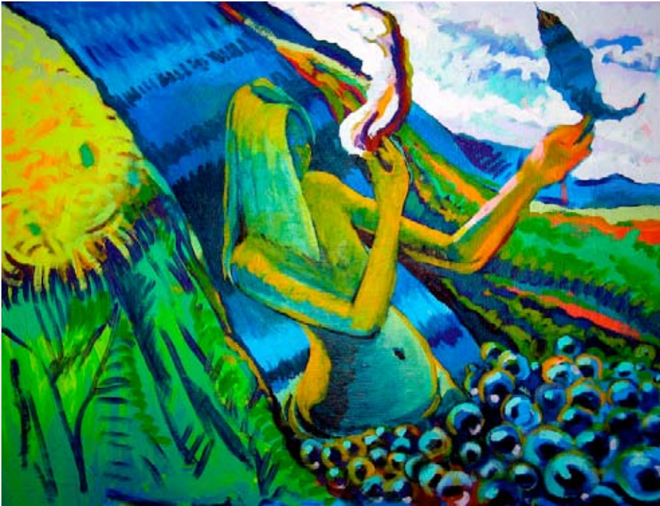
“Oshun”